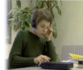
APP de Nancy