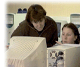
Antenne de l'APP de Millau

The individual teaching method is very convenient and is also useful in standard courses. Due to the fact that the speed of learning varies from person to person, teachers also use this method in standard courses or have learners work in small groups.