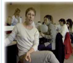
APP de Riom - formatrice

People need autonomy because in each course they will have a training program to follow and the teacher is there only to help people. There are no classic academic courses. In the same place somebody can prepare for an entrance examination such as a degree (license) in French and somebody else can just start learning French